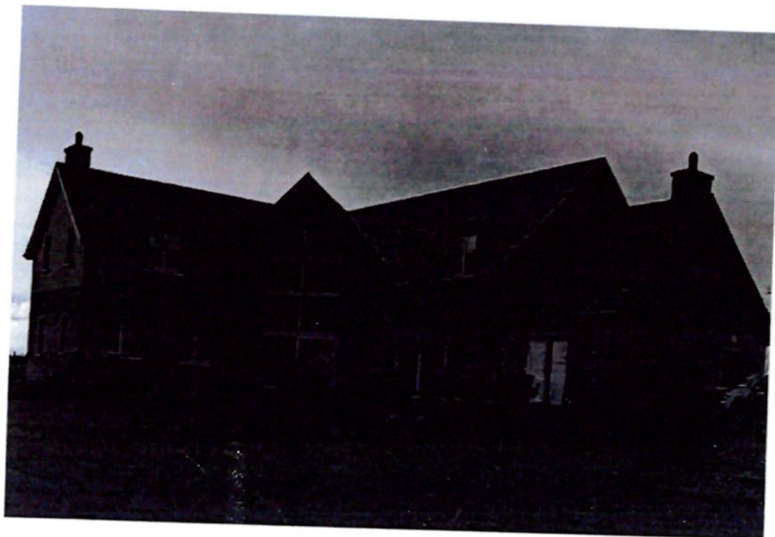
HOUSE CIRCLED IN GREEN.

* Colour images can be provided electronically if required.